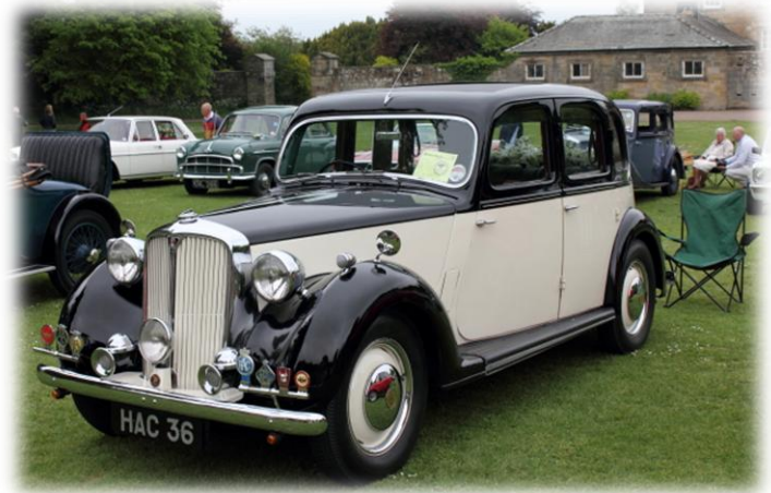
The winning “Other Classic”